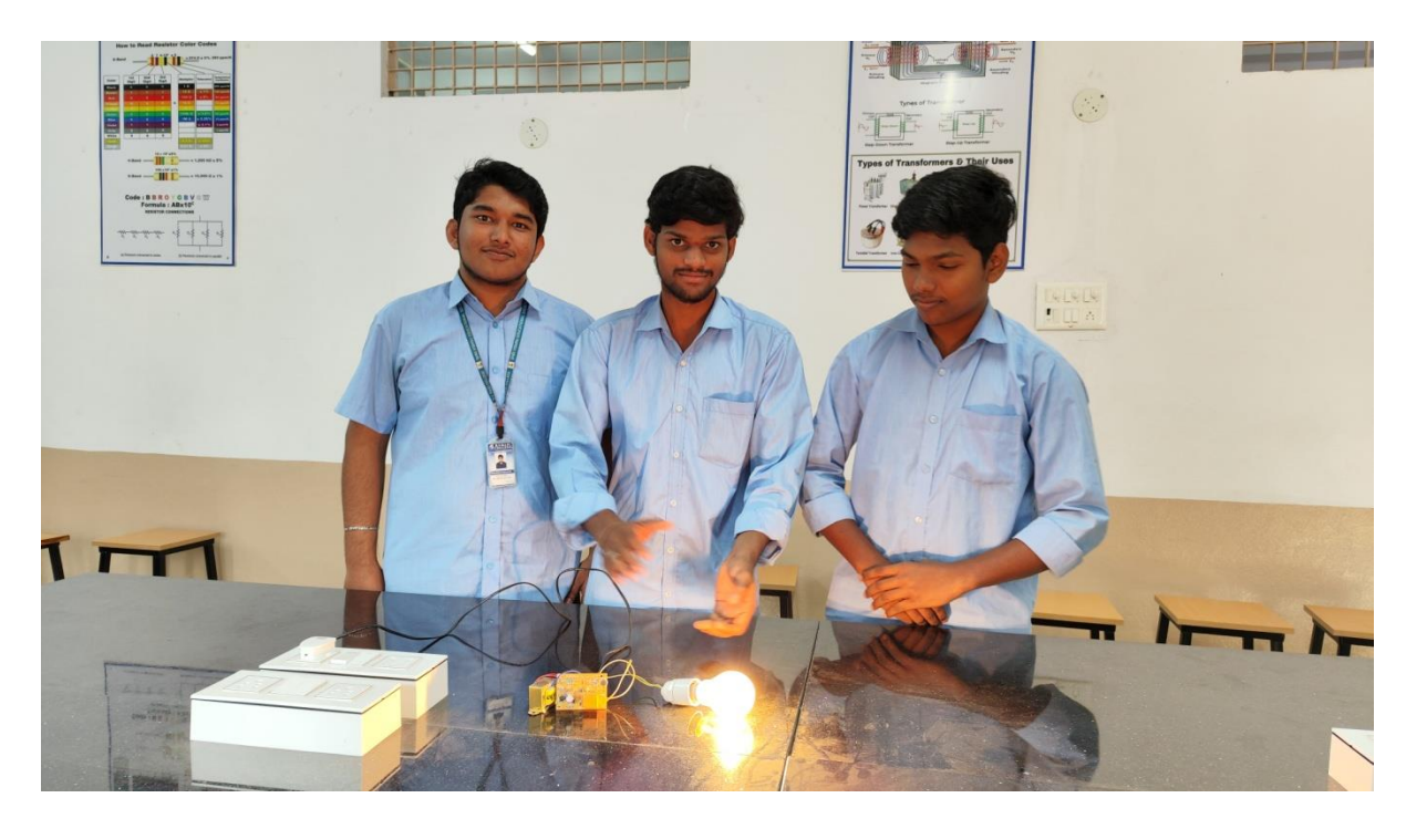
The above image shows that glowing of the bulb with the clap sound